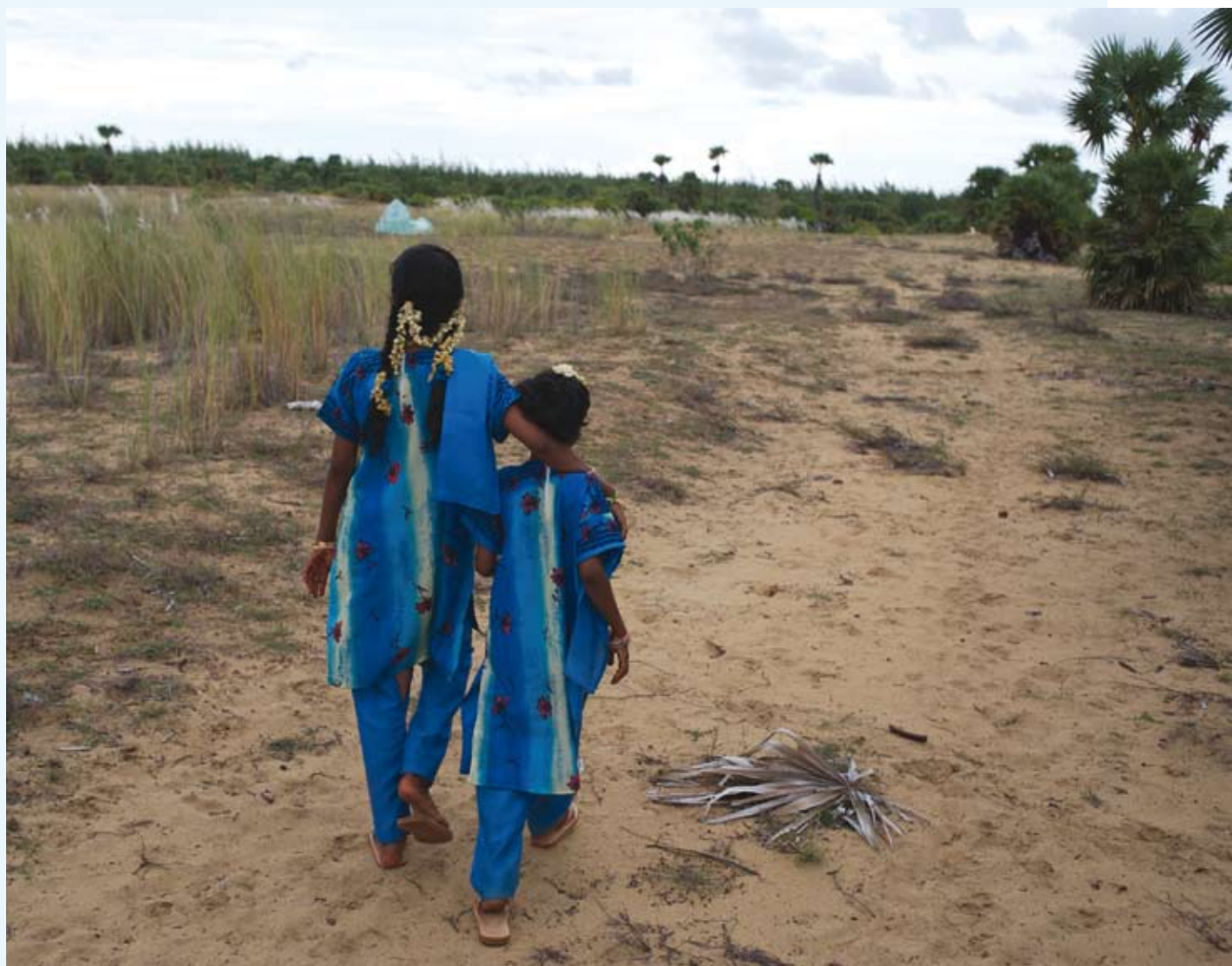
These children are not victims of trafficking.