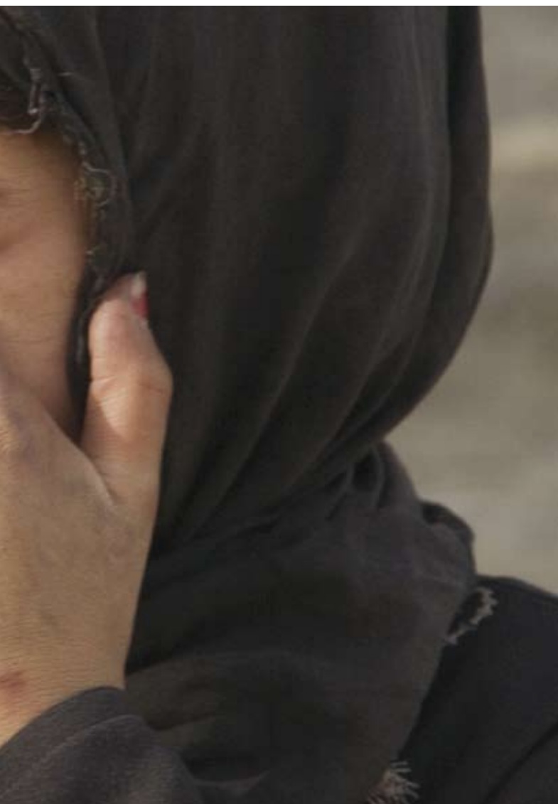
This child is not a victim of trafficking.

The Government of the United Arab Emirates provided funding to UNICEF Bangladesh for the repatriation and reintegration of the 250 children formerly involved in camel racing. Some of the funds covered the expenses of partner non-governmental organizations involved in rehabilitation and reintegration of trafficked children. The remaining funds will be devoted to the livelihood components of the project, awareness-raising activities and strengthening follow-up with community care committees.