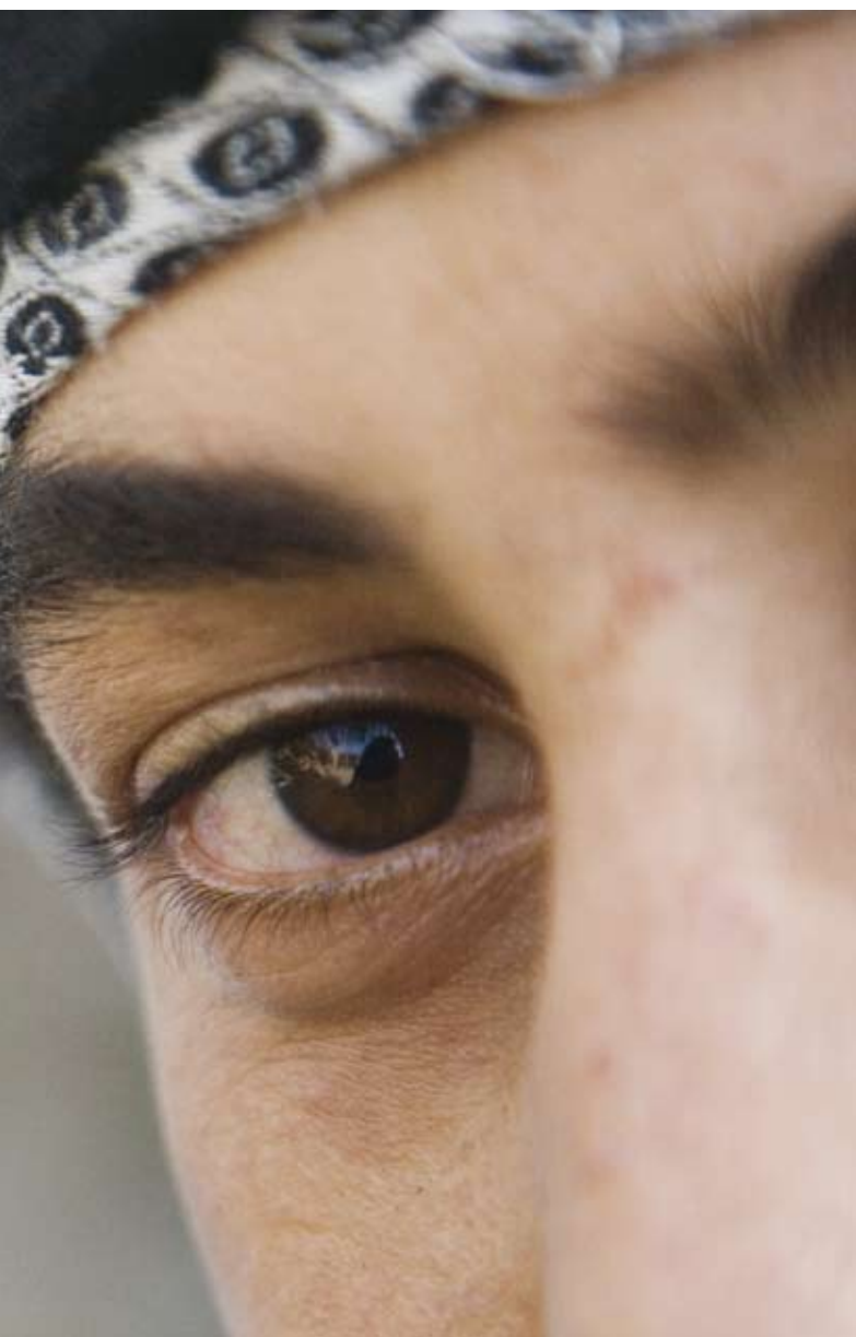
These children are not victims of trafficking.

Guided by the principle of the best interests of the child, a decision was made to address repatriation on a case-by-case basis. UNICEF Bangladesh promoted a plan of action for the repatriation, rehabilitation and reintegration of the children. They had already been identified by local authorities in the United Arab Emirates, where they were placed in shelter homes or transit centres. Some camel owners handed over the children after participating in an awareness-raising campaign; other children were identified during visits to the camel farms. The Government of Bangladesh would not accept any child for repatriation without first reviewing and sharing the registration files to ensure that all children accepted for repatriation were indeed from Bangladesh, and that all procedures had been properly followed.