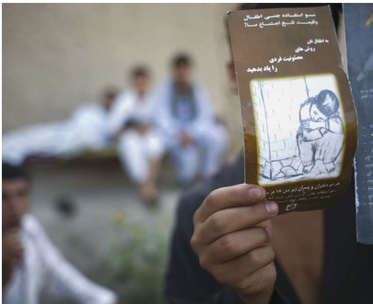
This child is not a victim of trafficking.

The case studies may not be universally representative or replicable, and the findings are based on assessments by those involved in implementation, rather than on evaluations or broader impact assessments. They have been identified by UNICEF country offices to provide lessons that can be considered by other countries in the region or beyond in developing programmes to combat child trafficking.