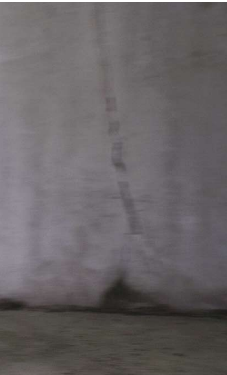
This child is not a victim of trafficking.

Unknown numbers of children are trafficked within and across the borders of South Asia. They are trafficked into situations of exploitation and abuse such as hazardous labour, commercial sexual exploitation, domestic servitude, begging and criminal activities. Trafficking represents a failure to protect the rights of the most vulnerable children. Until recently, few people in affected communities spoke of trafficking, and efforts to fight it emphasized criminal responses rather than protection and reintegration of trafficked children.